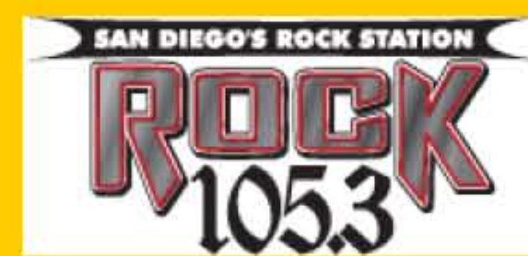
Ashlee The Show, Rock 105.3